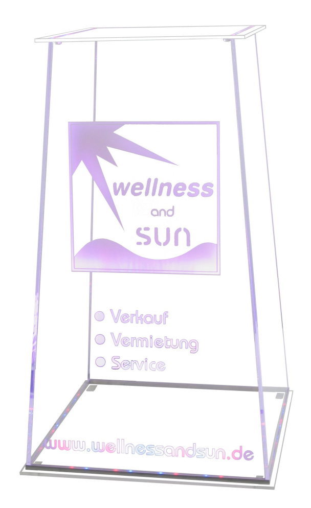
(Wellness and Sun from Schortens).

Plexiglass - 350 x 250 x 600 x 5mm Plexiglass Cover - 280 x 280 x 5mm Plexiglass Base Plate - 380 x 380 x 5mm